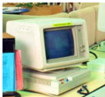
My old computer

I started out of a tiny 600 square foot apartment, where I barely had any room for books or courses.